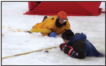
THIN ICE RESCUE